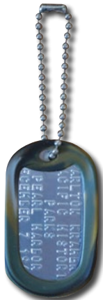
4 1/2" chain

T he issuing of military identification tags goes back to the US Civil War. During World War I, these official identification military personnel tags were nicknamed "Dog Tags". As World War II started, a second tag was added that was suspended by a shorter length of chain so that one tag could be removed "on death or capture", leaving the other in place. Plastic silencers were created around the two dog tags to ensure that the sailors and Marines wouldn't create any unnecessary noise when wearing them.